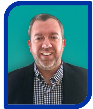
Underwriter: Pete Flanagan